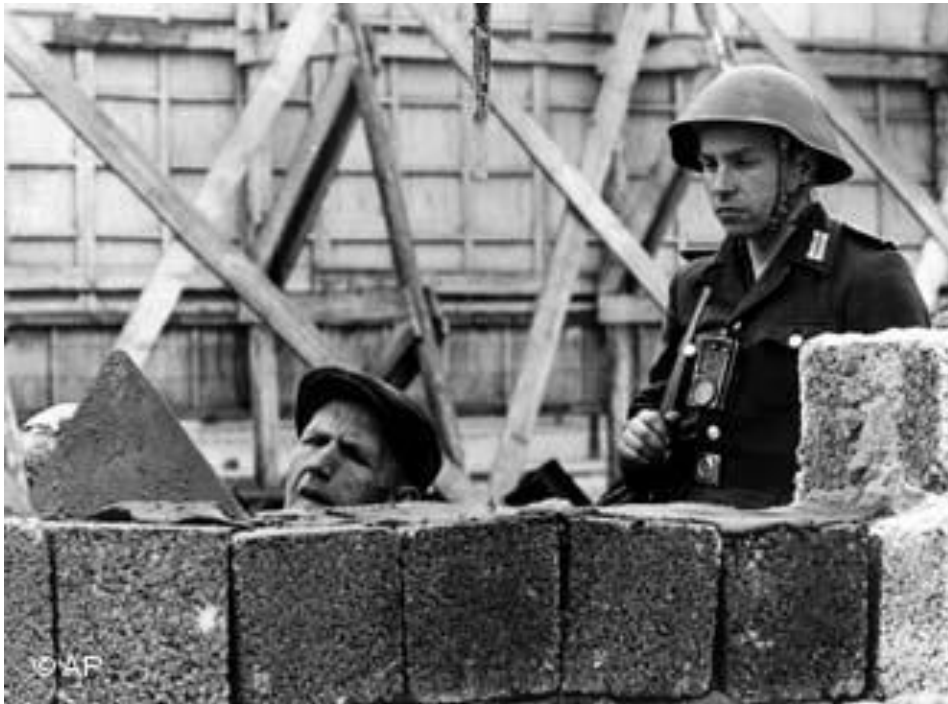
Building of the Berlin Wall, 1961.